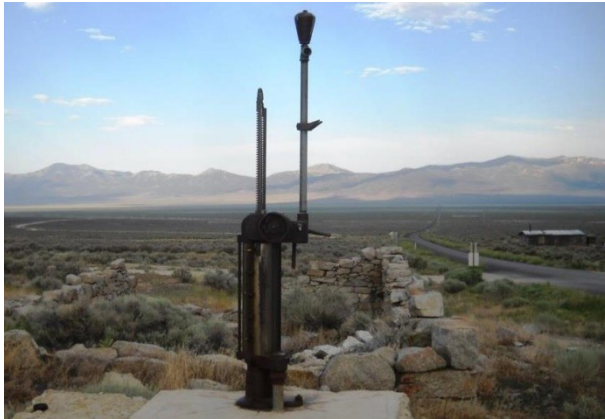
Building foundations and road leading into town with the same old gas pump