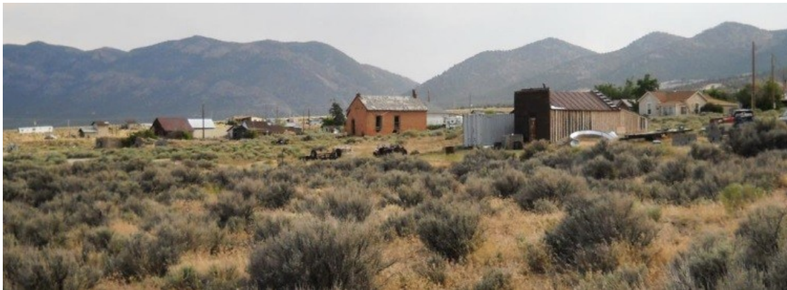
Cherry Creek present day