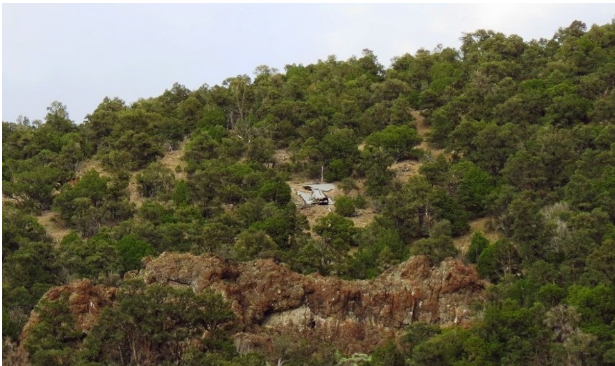
Airplane Canyon, object zoomed in

While hiking through the wilderness I could hear the birds squabbling and the wind howling. I could image what it was like for gold prospectors seeking treasure. I was experiencing what it is like to haul myself and equipment up the mountain through the rough terrain. I was doing the same thing as the prospectors, but the treasure that I was seeking was the truth about what happened so long ago. I kept wondering what I would discover on the mountain.