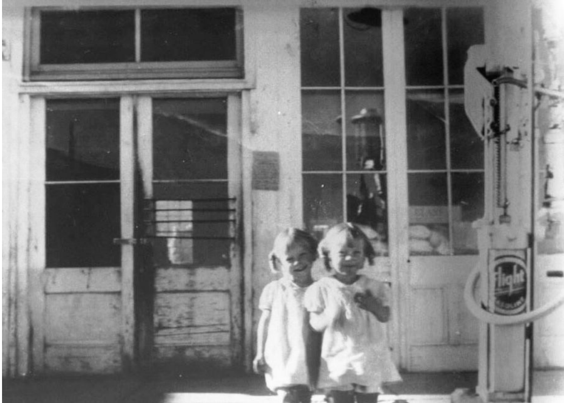
Cherry Creek store with gas pump on the right front