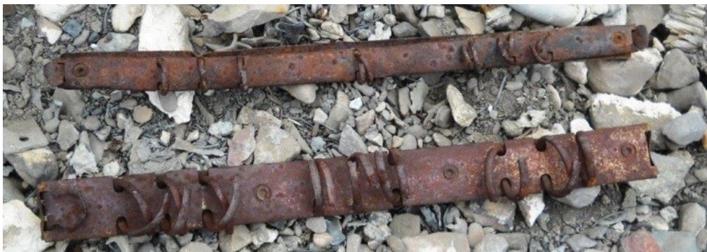
Burned binder rings found at the crash site

A couple of binder rings were found. They must have contained the flight logs, maps and check lists from the pilot. They were a vivid reminder of the personal tragedy that took place there.