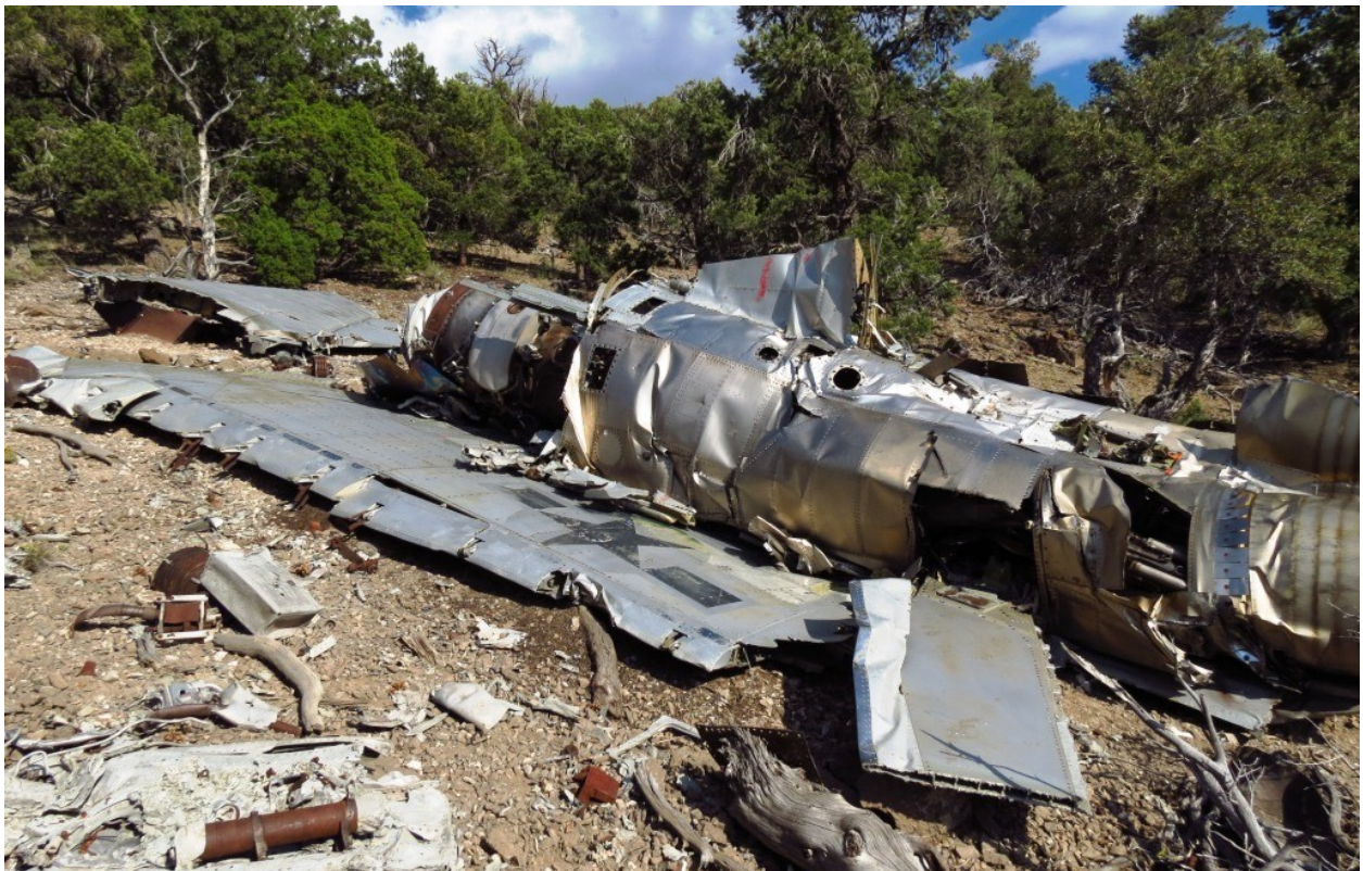
Left side view of wrecked F-100C in Airplane Canyon