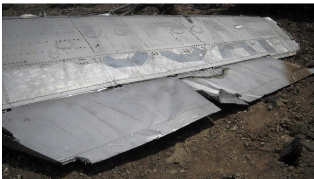
USAF on top of wing still readable

Both wings were separated from the fuselage. I could still read the USAF on the upper wing and the insignia on the bottom looked good.