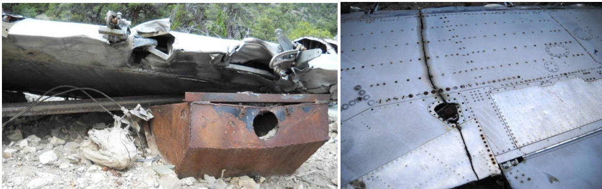
Ore car rail and container used to melt down aluminum under wing that had torch marks from the scrapper

Why is the aircraft in its current condition? It appeared that decades ago someone attempted to salvage and scrap parts from the wreck. The vertical tail was cut off and is missing. Torch marks remain where they tried unsuccessfully to cut up the remainder of the wreck. One wing had a torch cut through the top, but it did not get through the main structure. There is an ore car track under one wing most likely used as a leverage bar. Several other parts had torch marks from attempted salvage operations before the scrapper gave up.