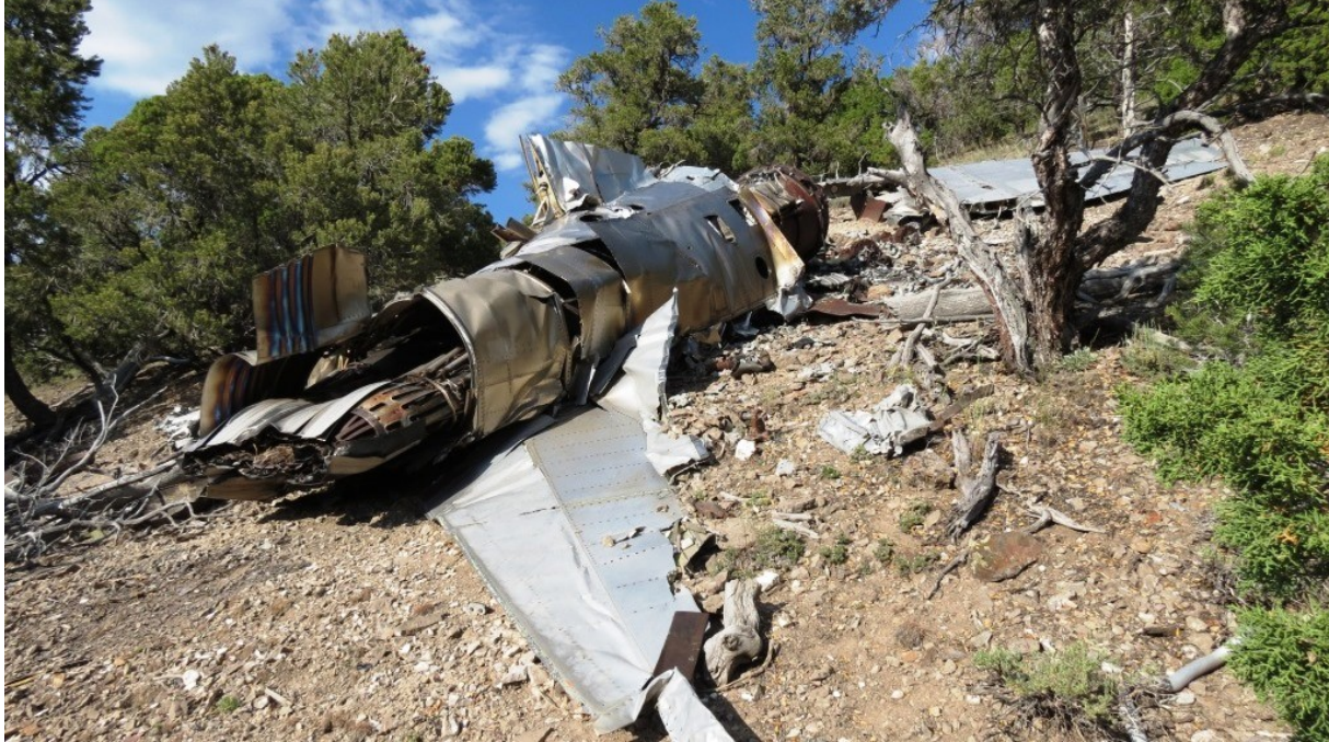
Right side view of F-100C in Airplane Canyon