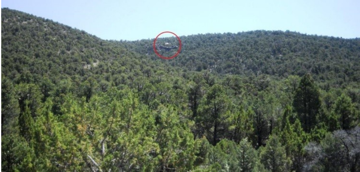
Airplane Canyon, object of interest circled in red, photo by Dave Trojan