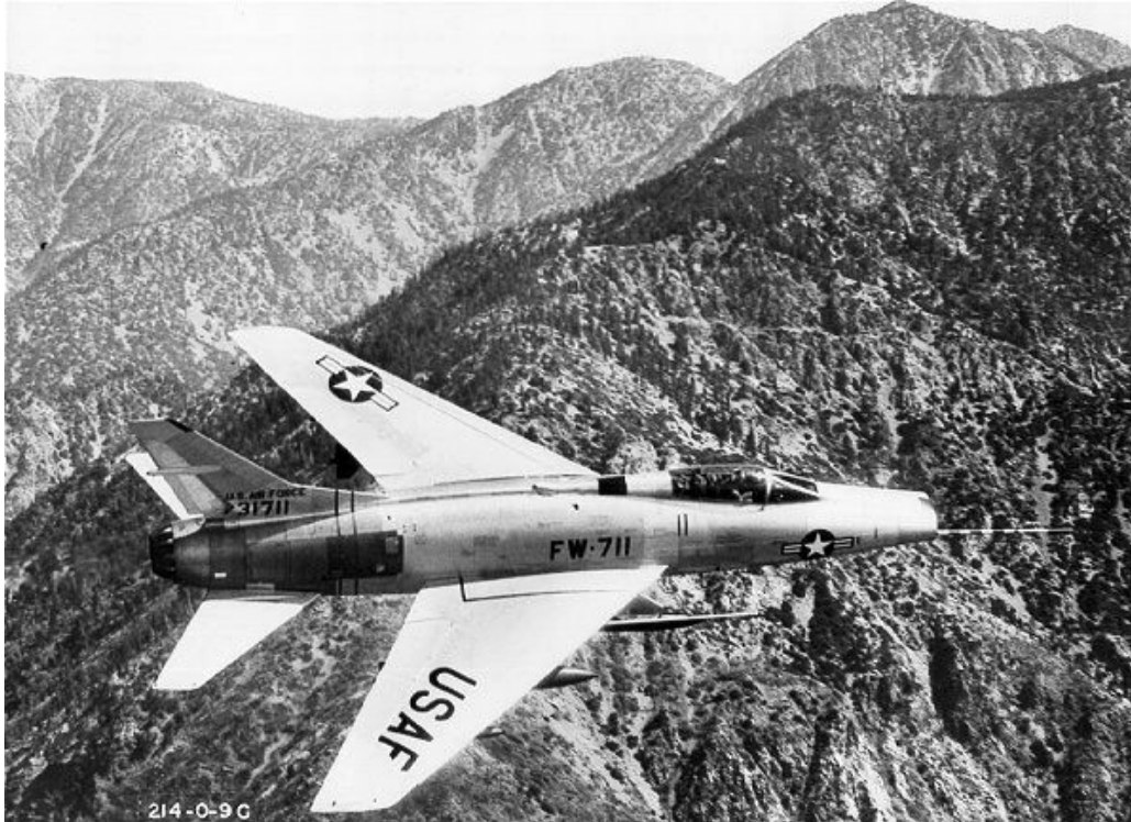
F-100C Super Sabre

A radar search was immediately conducted seventy miles in front of and behind the flight of jets using both height and search radar, but contact could not be established with Lt. Bacon's aircraft. There being nothing further the flight could do, they proceeded to George AFB and landed at approximately 2135 hours. First Lieutenant Samuel K. Bacon Jr. was lost.