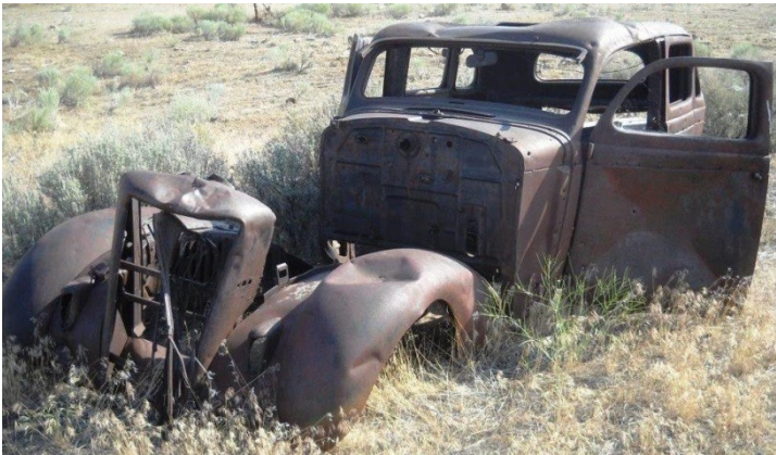
Relics from the past litter the town