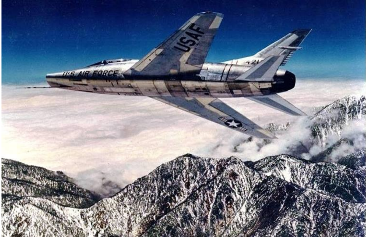
F-100C Super Sabre

By Dave Trojan, davidtrojan@earthlink.net