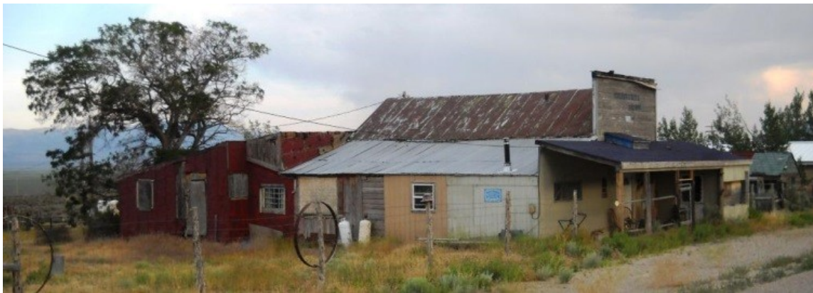
This building was the last saloon in town to close