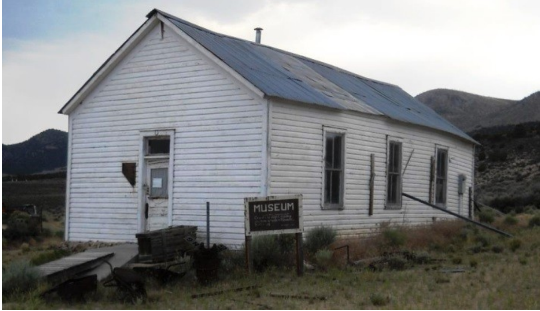
Old school house and now town museum