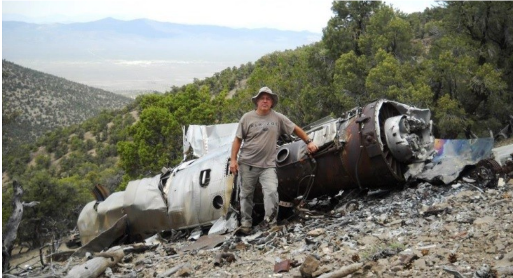
Me at the crash site

At the crash site we spent a couple of hours carefully examining the wreckage. The wreck was laid out pointing uphill and there was trail of debris from its impact point below.