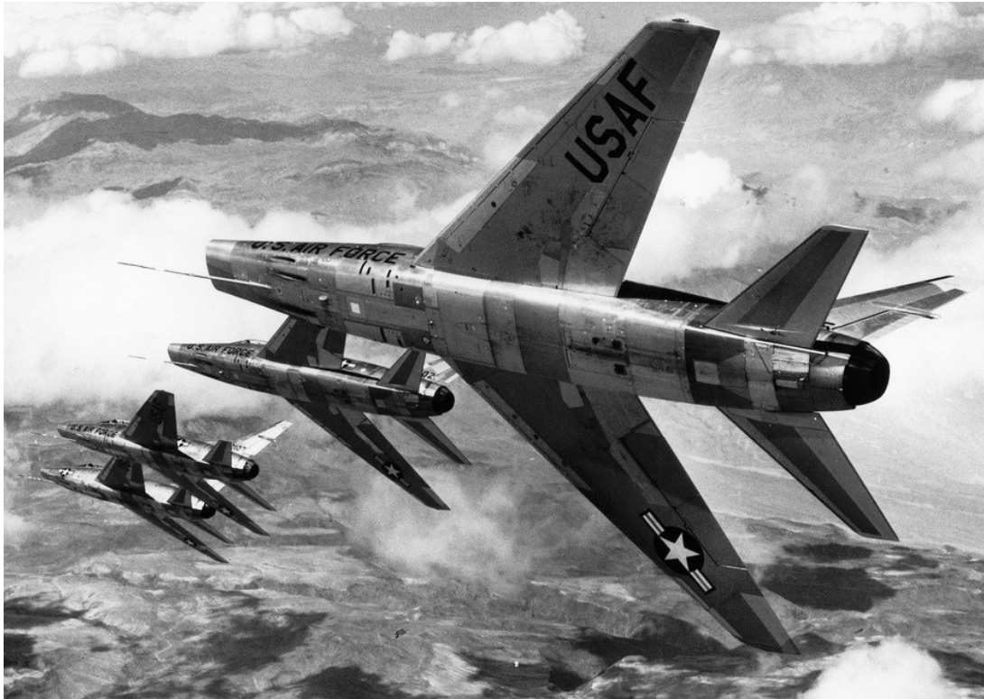
F-100C Super Sabres of the 479th Fighter Day Wing, George AFB, CA

As the cloud tops were becoming lower, the flight leader called his element to “close in,” so as to descend to a lower altitude. He then repeated the order without response from Lt. Bacon. Immediately there-after Lt. Bacon’s aircraft was observed dropping slowly out of sight and into the cloud tops and Lt. Bacon was heard to say that he had lost sight of the flight. Lt. Bacon was then told the heading, altitude and airspeed of the element while the flight began a slow descent to 40,000 feet, remaining 1,000 feet “on top”.