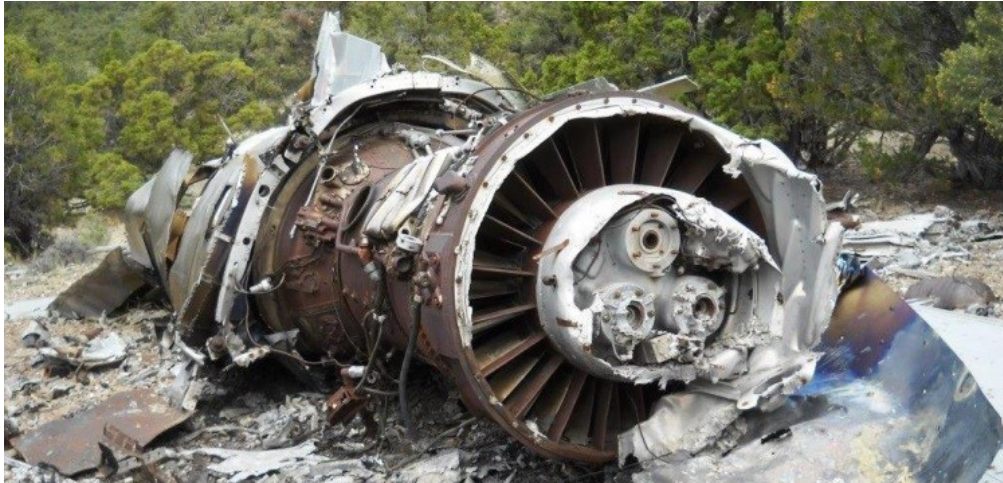
J57 engine relatively intact

A couple of binder rings were found. They must have contained the flight logs, maps and check lists from the pilot. They were a vivid reminder of the personal tragedy that took place there.