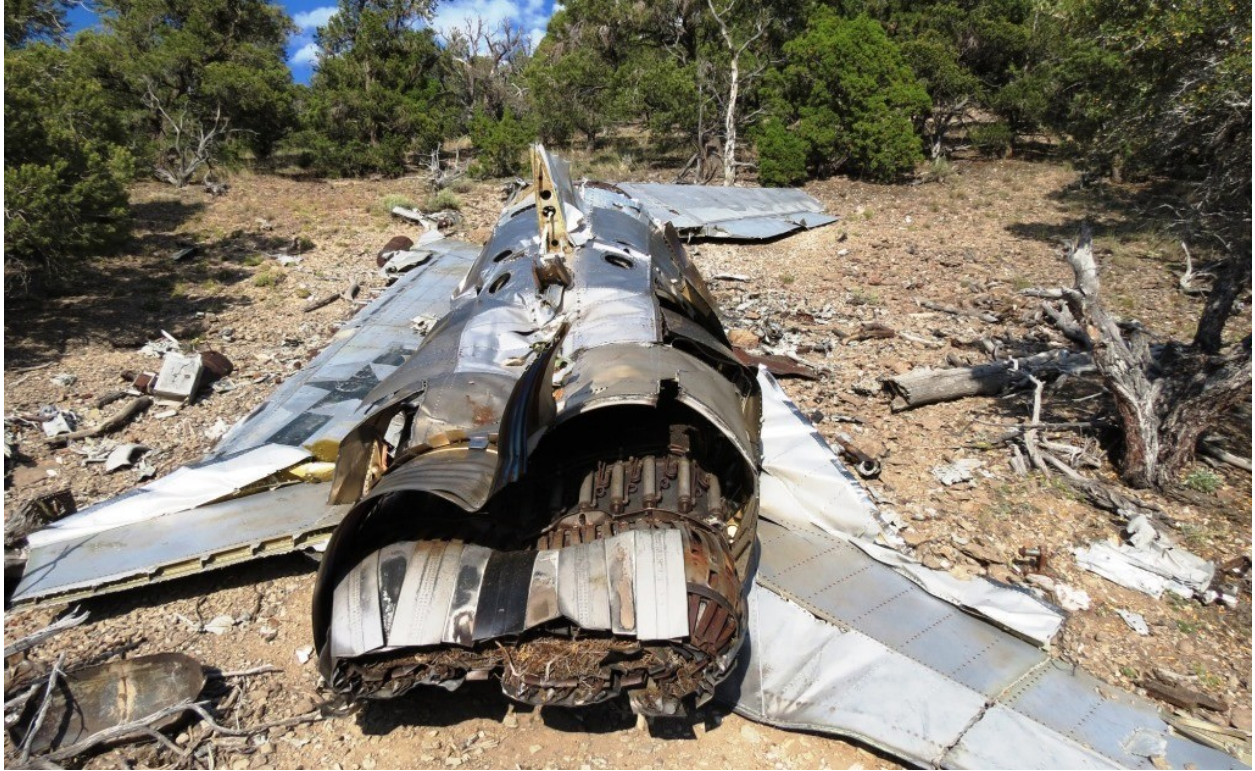
F-100C Super Sabre wreck laid out on the mountain