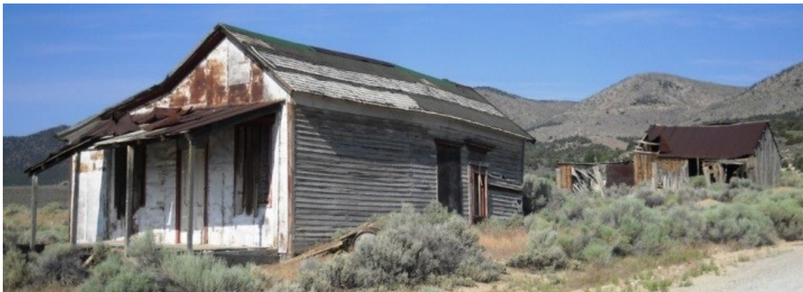
Abandoned buildings in Cherry Creek