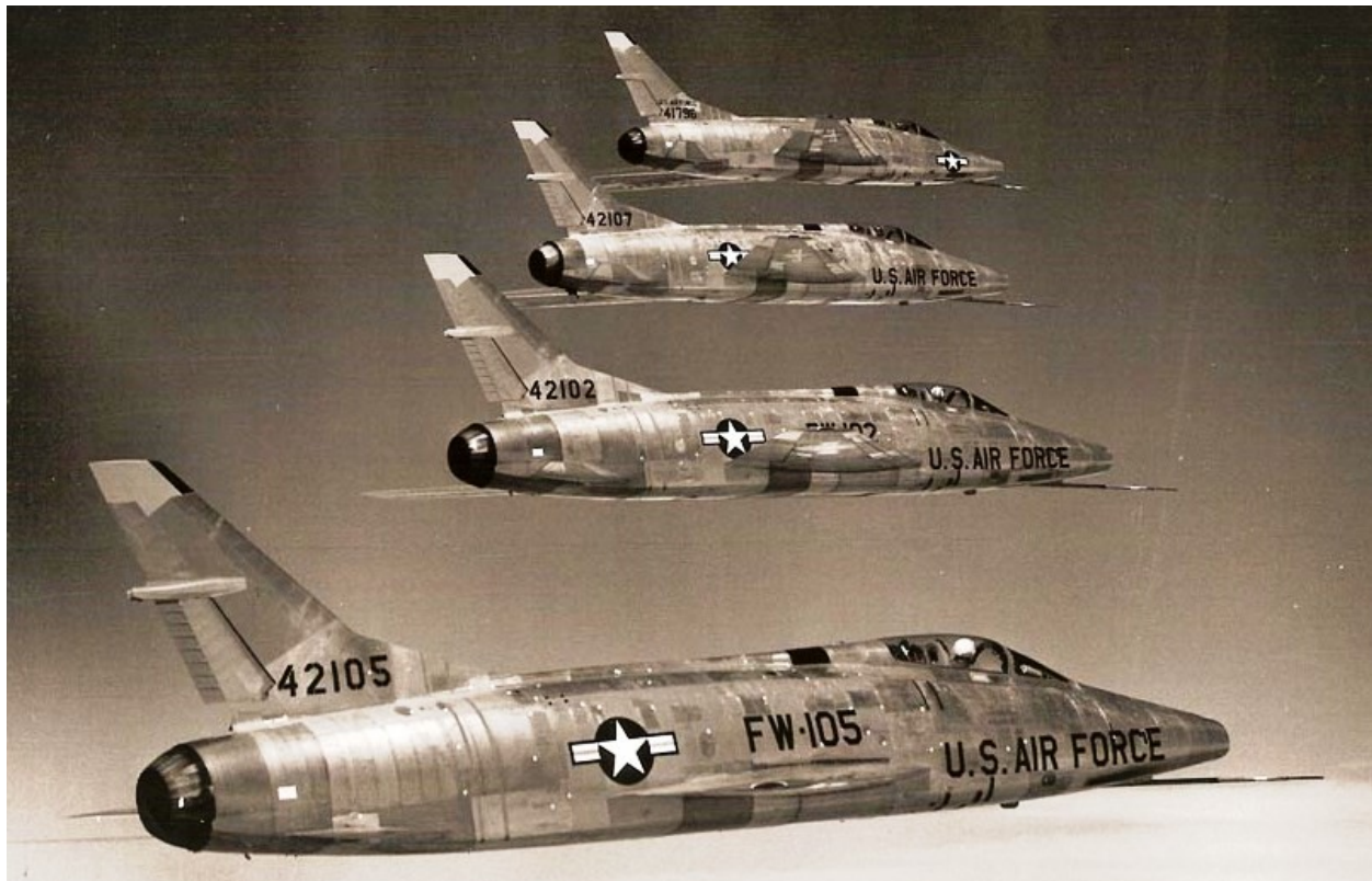
A formation of F-100C Super Sabres from the 434 FBS 479 FBW George AFB