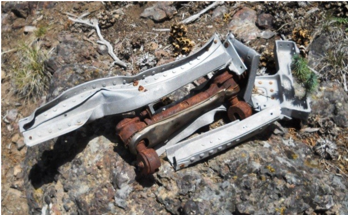
First piece of unidentified plane wreckage found

We passed by a test mine honed out of the rock by miners in search of gold. I'm sure it was very hard labor to carve out a hole in the rock, only for it to come up empty of gold. The hike was hard labor due to its high altitude, but the search continued through the thick brush and steep terrain. Several hundred feet from the wreck site we found our first piece of debris from the aircraft. It was most likely placed there as a guide marker to the site. We knew we were getting close, but we still could not see it because thick brush obscured our view.