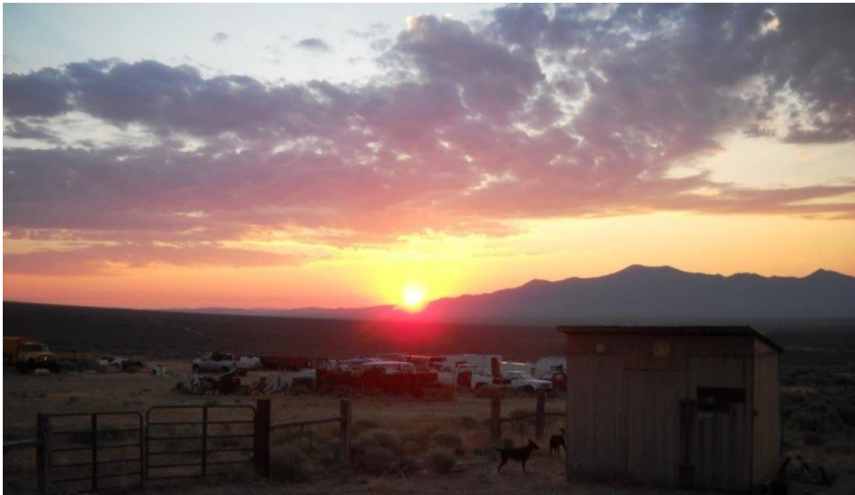
Sunrise not sunset over Cherry Creek Nevada