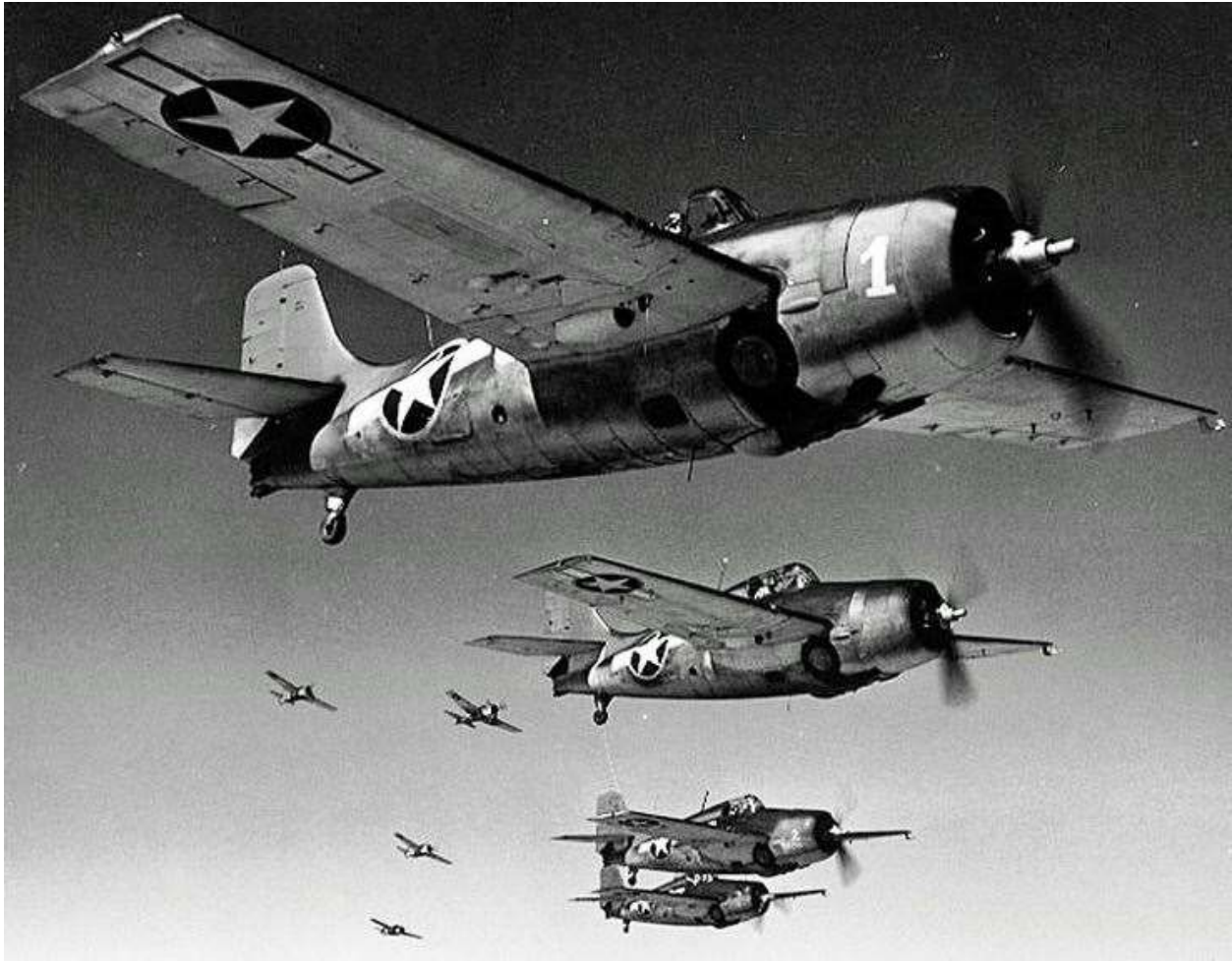
Wildcats in flight