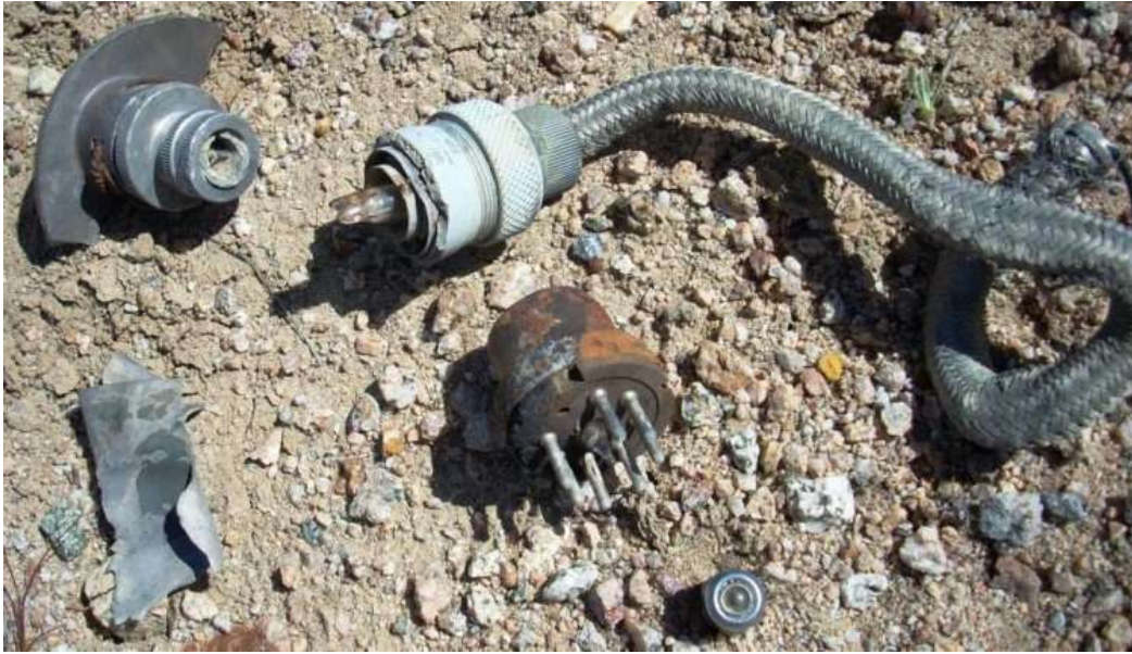
Artifacts at the crash site March 2009