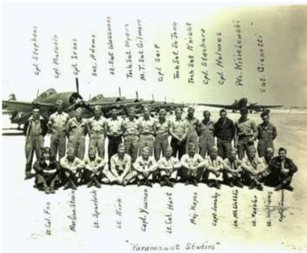
Squadron members who participated in the film Wake Island