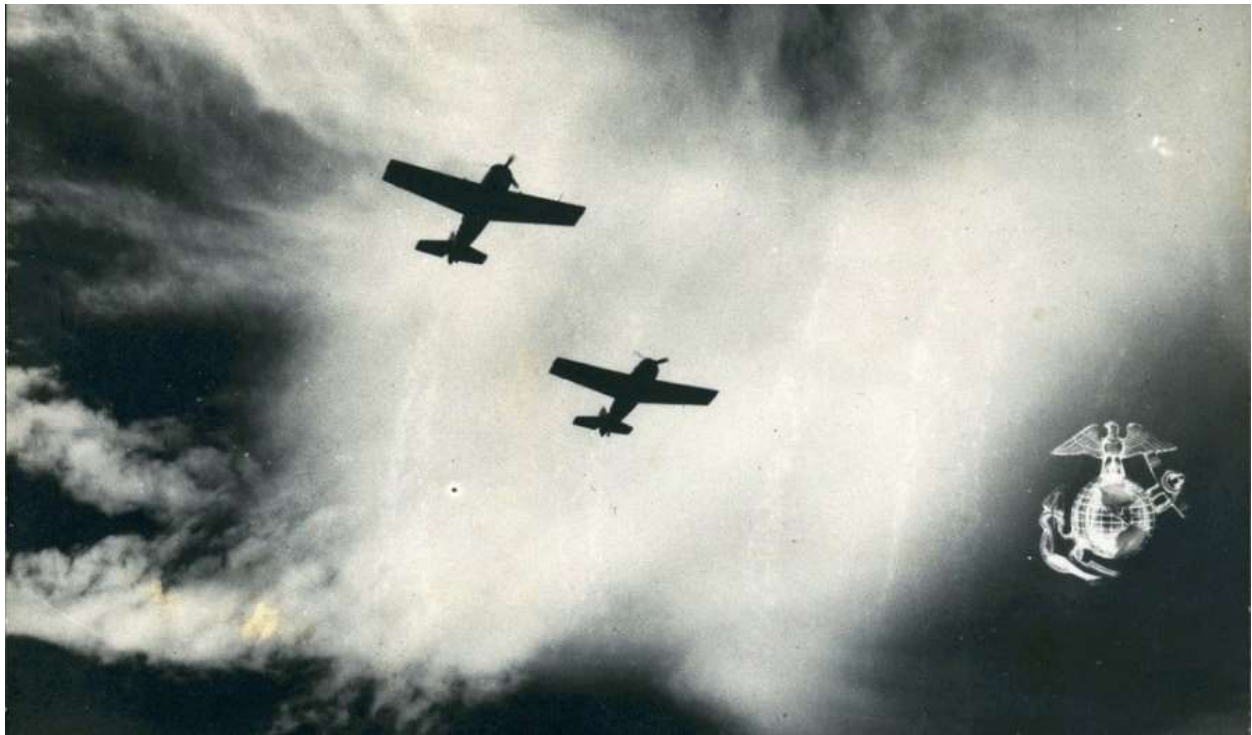
Wildcats from VMO-251 circa 1942