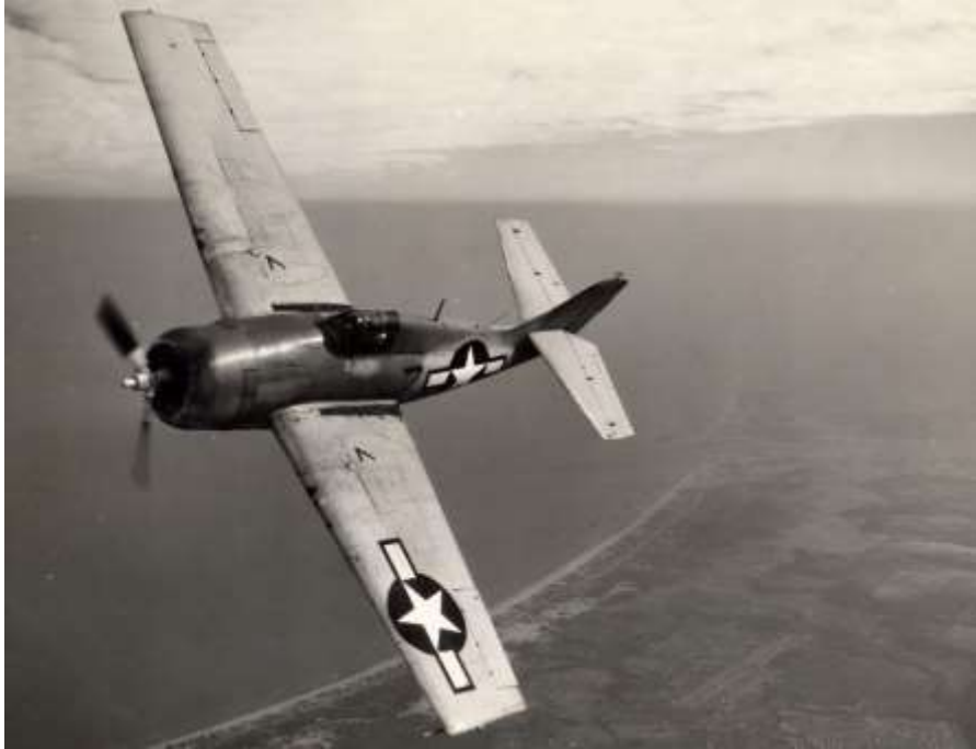
General Motors (Eastern) FM-1 Wildcat in flight, circa 1943

Exploring the crash site of FM-1 Wildcat, BuNo 15442, which crashed 16 Nov 1943