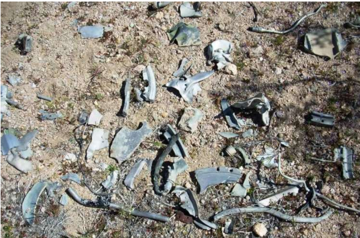
Main artifact pile from FM-1 Wildcat, BuNo 15442, March 2009