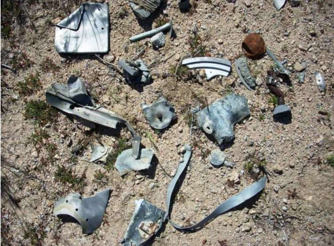
Artifact pile from FM-1 Wildcat, BuNo 15442, March 2009