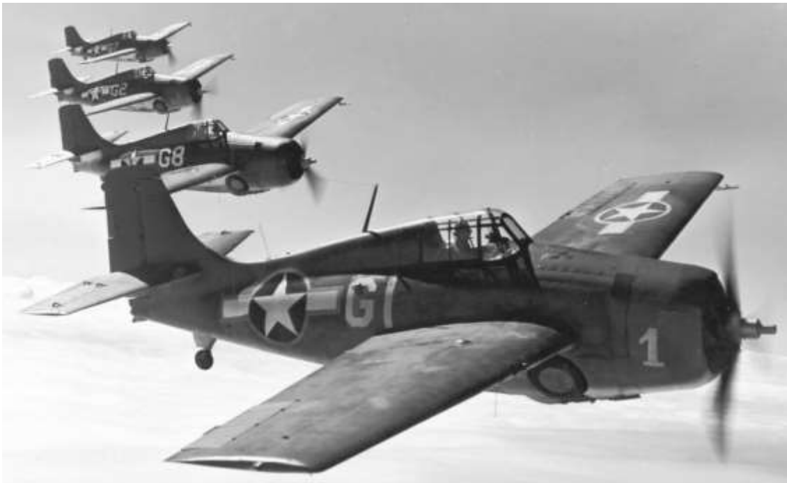
Grumman Wildcats in flight