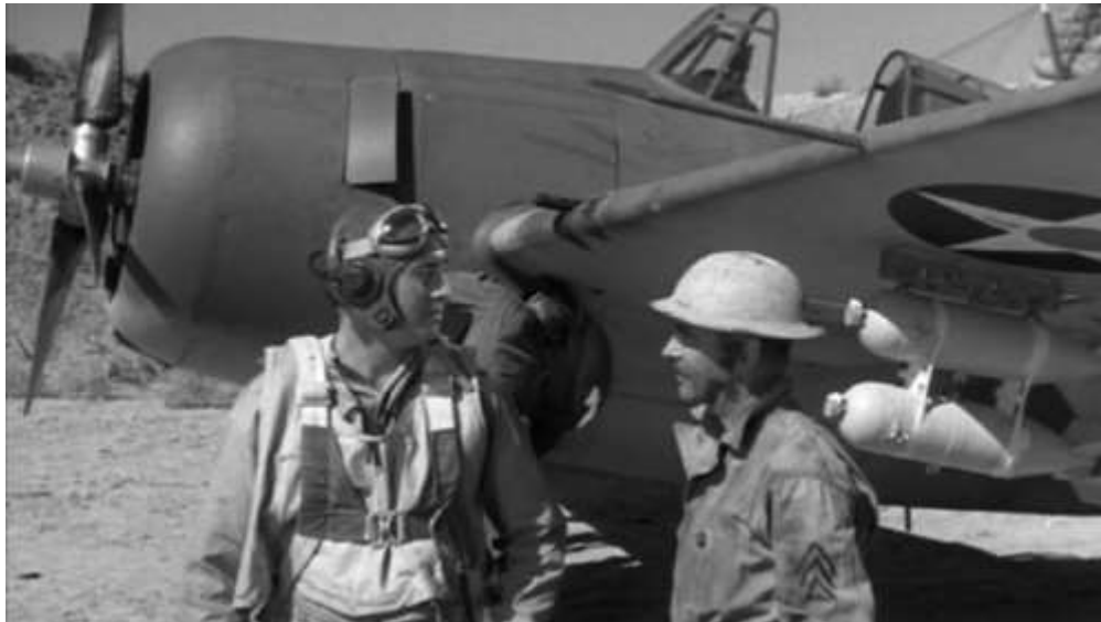
Screen shot from the movie Wake Island

FOOTNOTE: The Wildcats of VMO-251 were used in the filming of the movie "Wake Island" by Paramount Studios.