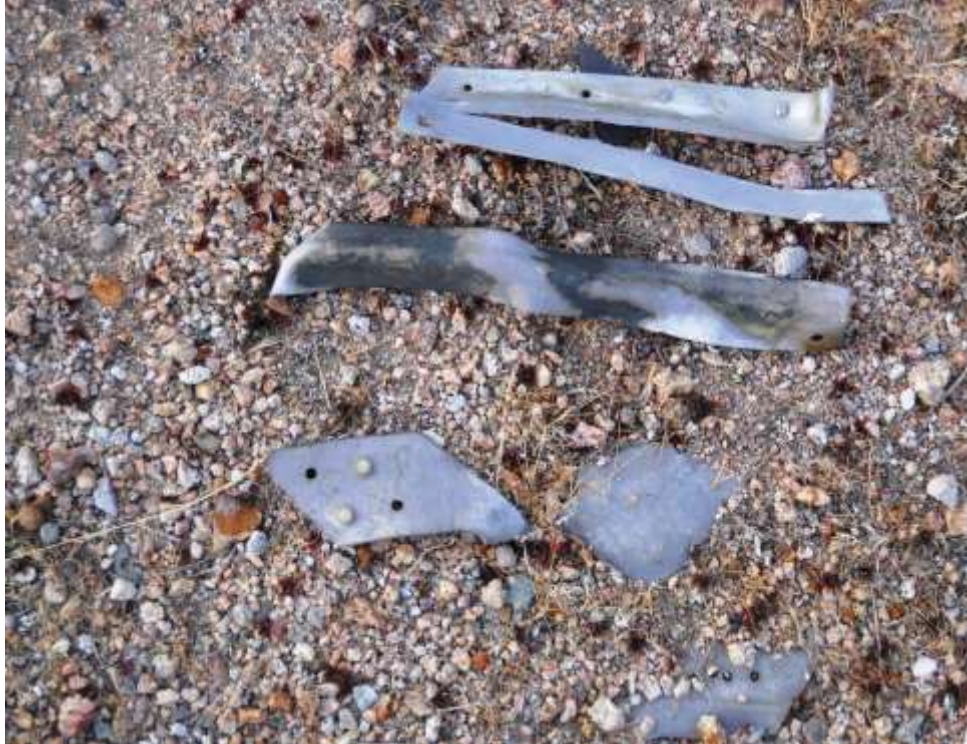
Artifacts at the crash site 2018

Many artifacts have disappeared and some are slowly sinking into the ground