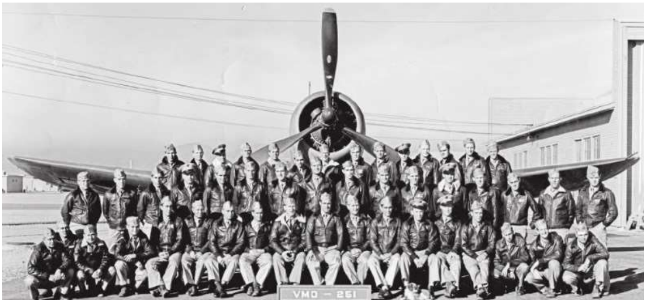
Ground officers and pilots of VMO-251 at MCAS Mojave, 25 October 1943, four of these pilots were killed during training accidents at MCAS Mojave

MCAS Mojave was one of the main training centers for Marine squadrons preparing to deploy overseas during World War Two. The desert location provided VFR flying conditions most of the time, non-congested airspace, and nearby bombing and gunnery ranges. The downside was occasional high winds that could make flight operations difficult. Furthermore, during late 1943, MCAS Mojave's runways were only 150-ft. wide. Inexperienced pilots, especially those in Wildcats, often lost control on landing and departed the runway.