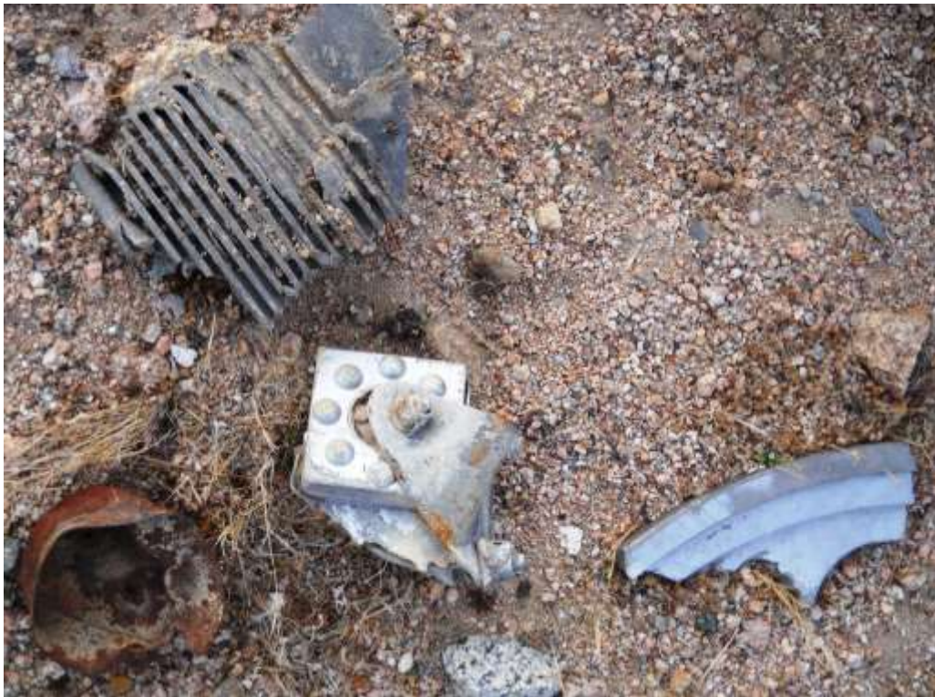
Artifacts at the crash site 2018, there were much less at the site compared to 2009