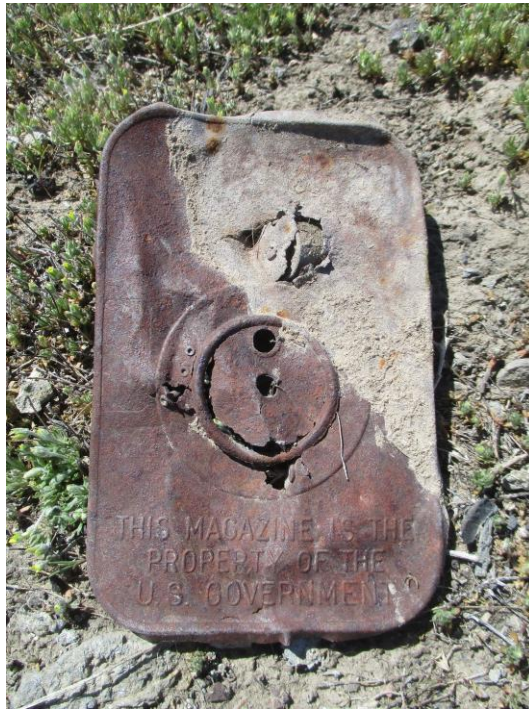
A lid to an Eastman Kodak 16 mm gun camera film magazine