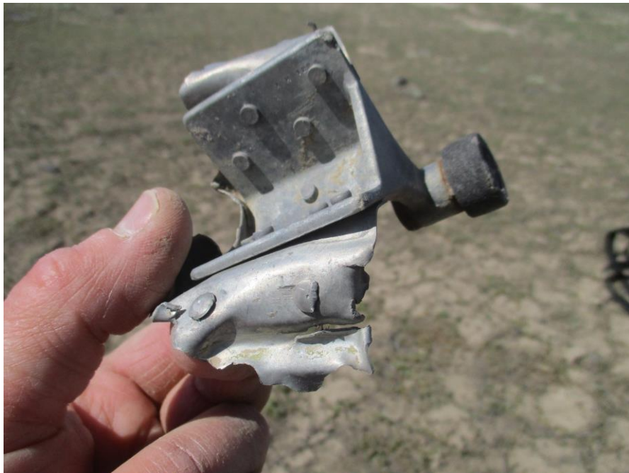
A roller mechanism from one of the bomb bay doors