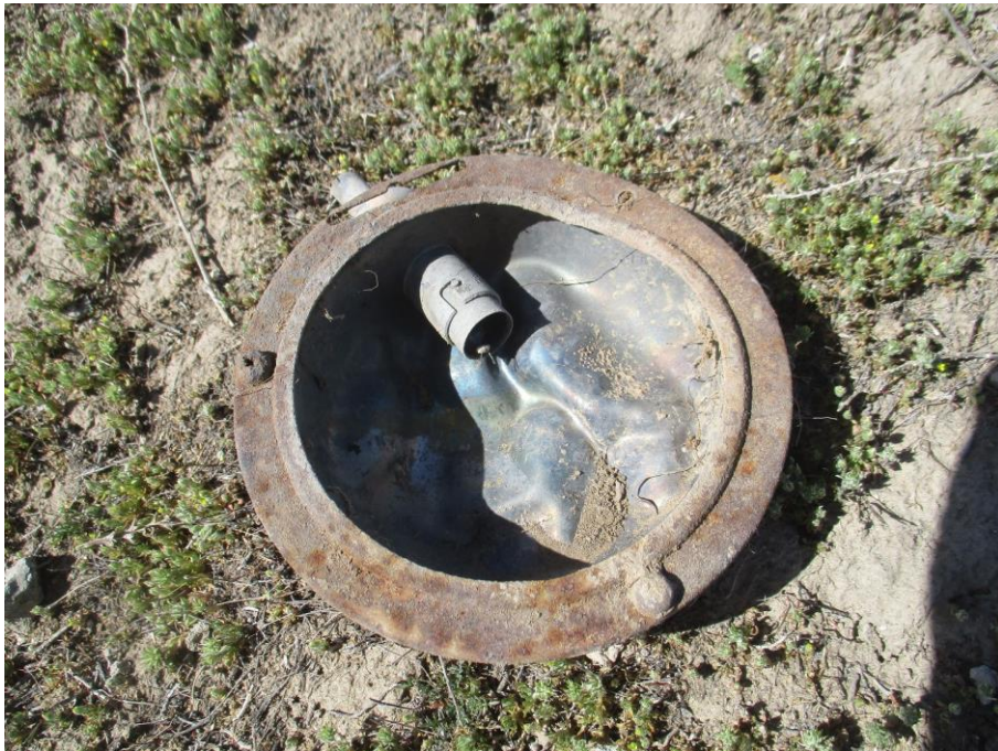
A light fixture