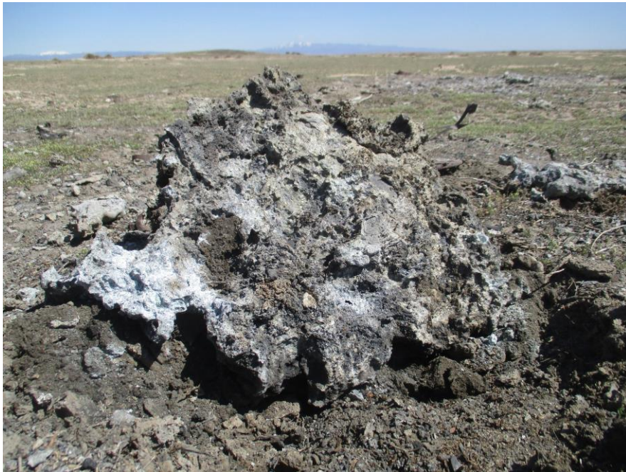
A very large chunk of melted aluminum