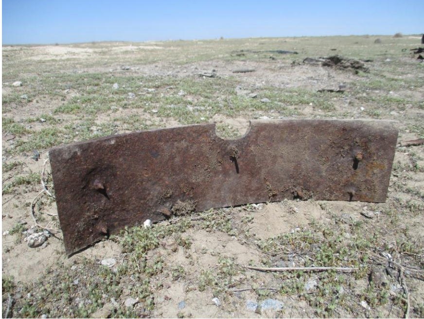
A large piece of armor plate