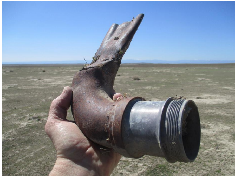
An intake manifold pipe from a Pratt & Whitney R-1830 engine