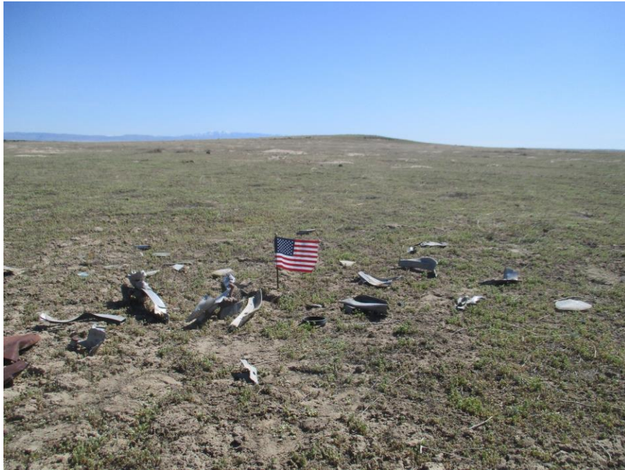
Shards of aluminum at the point of first impact