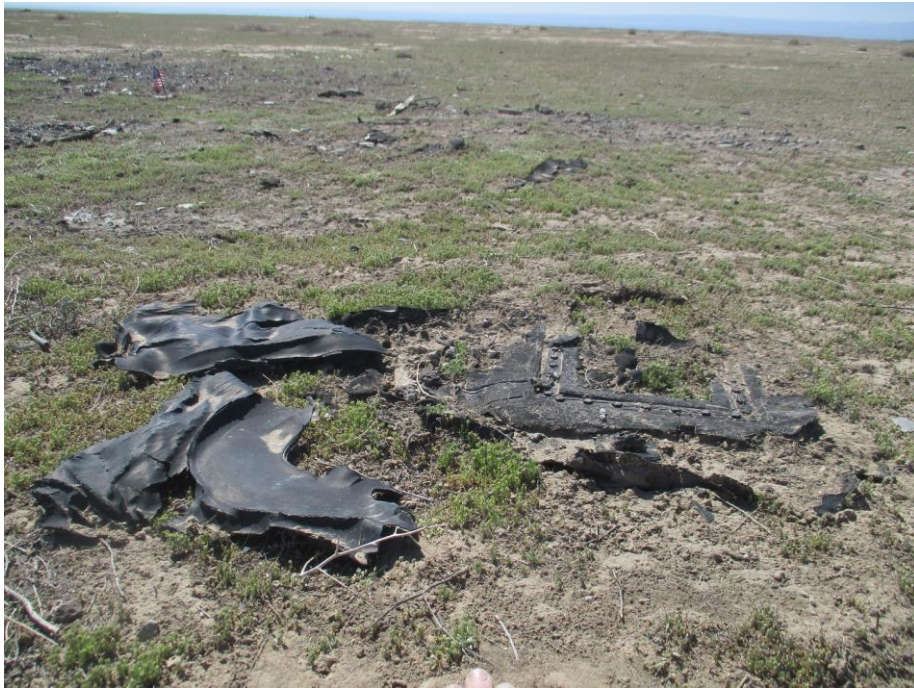
Pieces of self-sealing fuel tanks at the main crash site