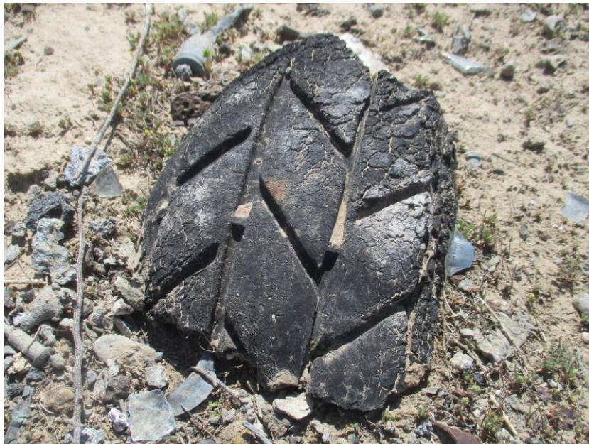
Tread from a landing gear tire