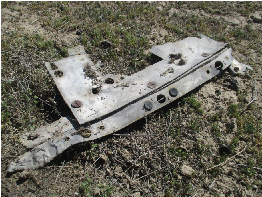
Part of an access panel with quick-release fasteners