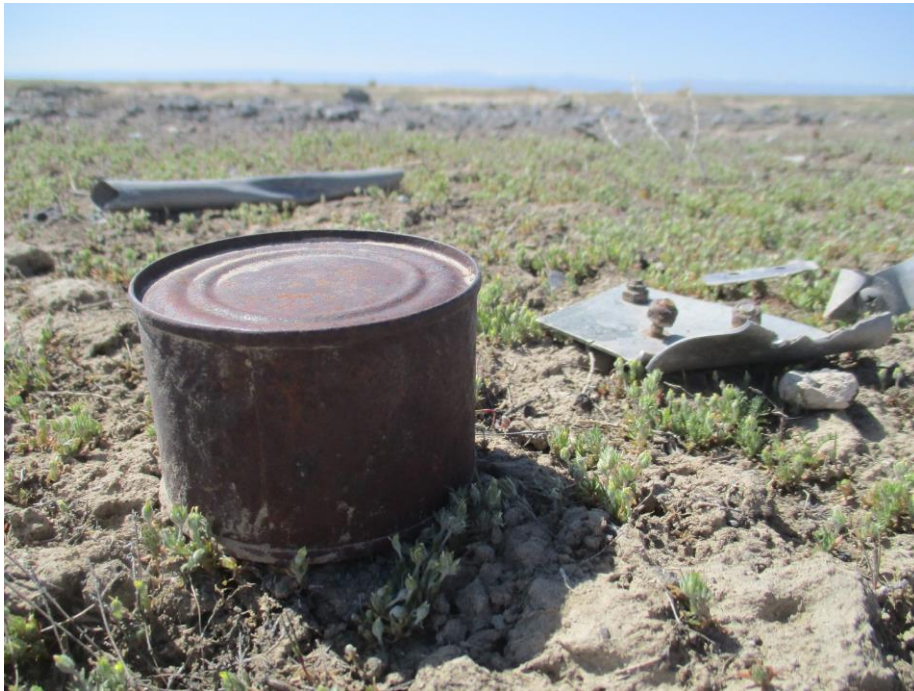
An unopened can of C-rations from World War II