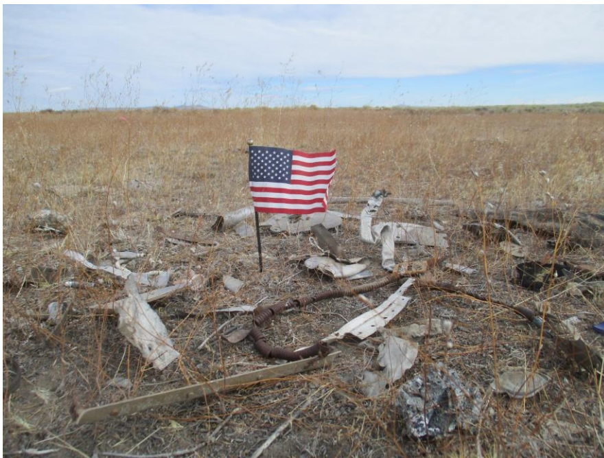
General view of the crash site