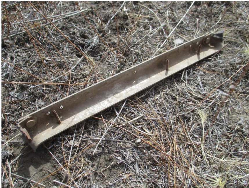
Aluminum stringer from the aircraft's framework