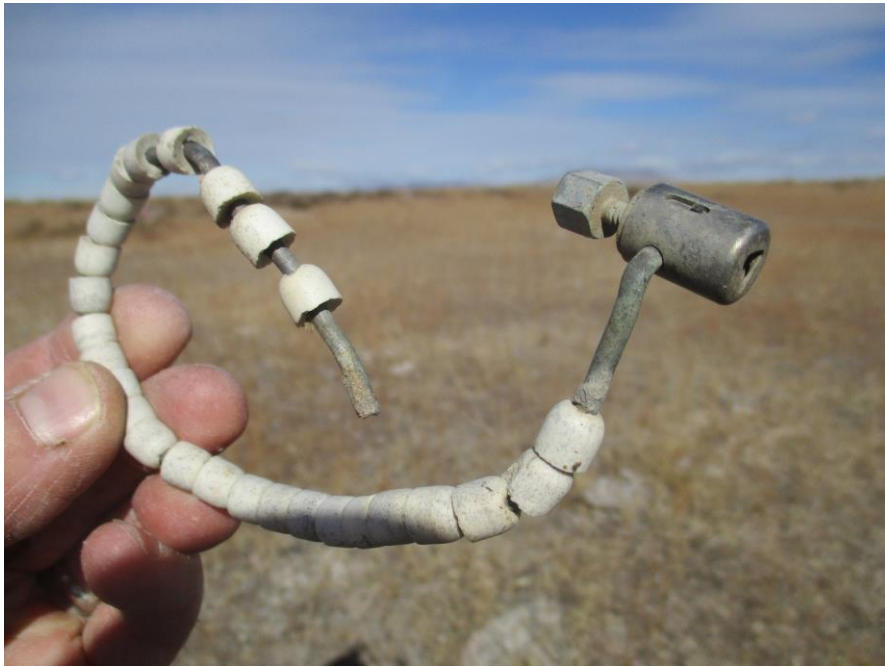
Curious-looking stainless steel wire with ceramic insulators