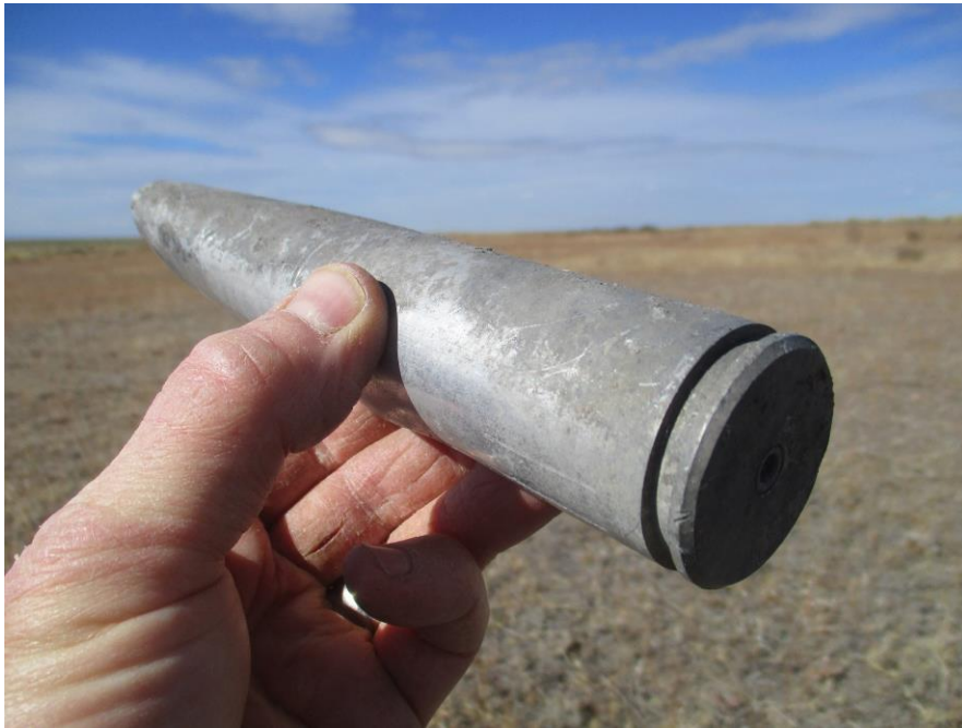
Spent flare gun cartridge