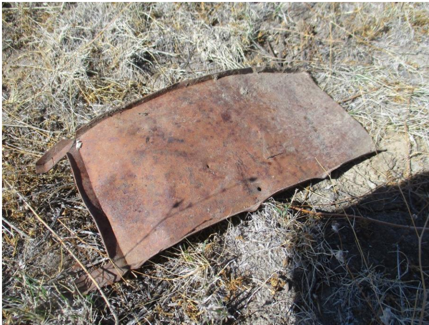
Lid from an ammunition box