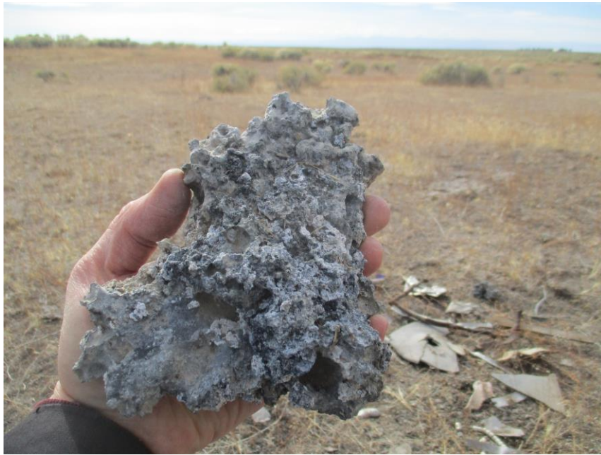
Badly burned aluminum engine part