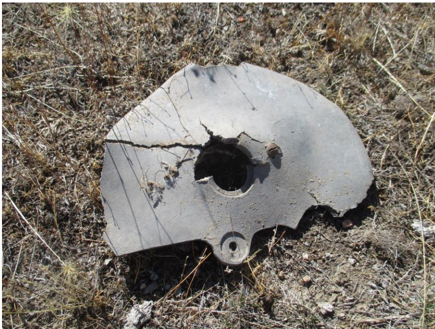
Piece of cast aluminum