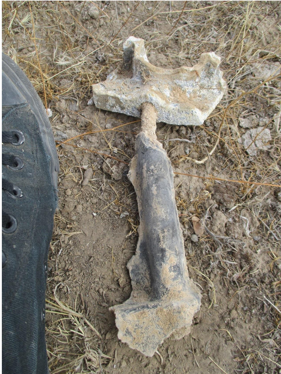
Heavy duty steel and aluminum piece, possibly from landing gear