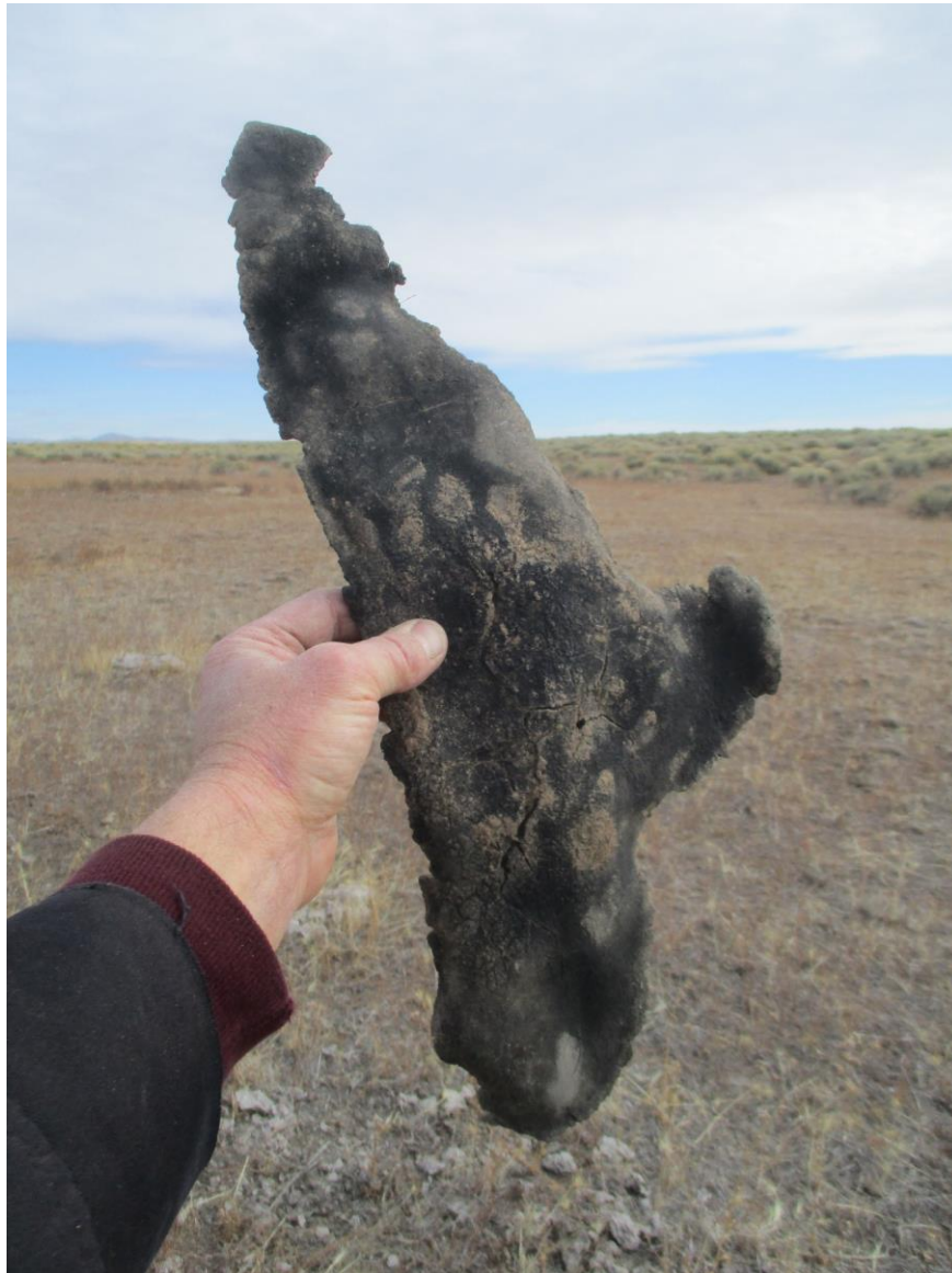
Rubber from a self-sealing fuel tank