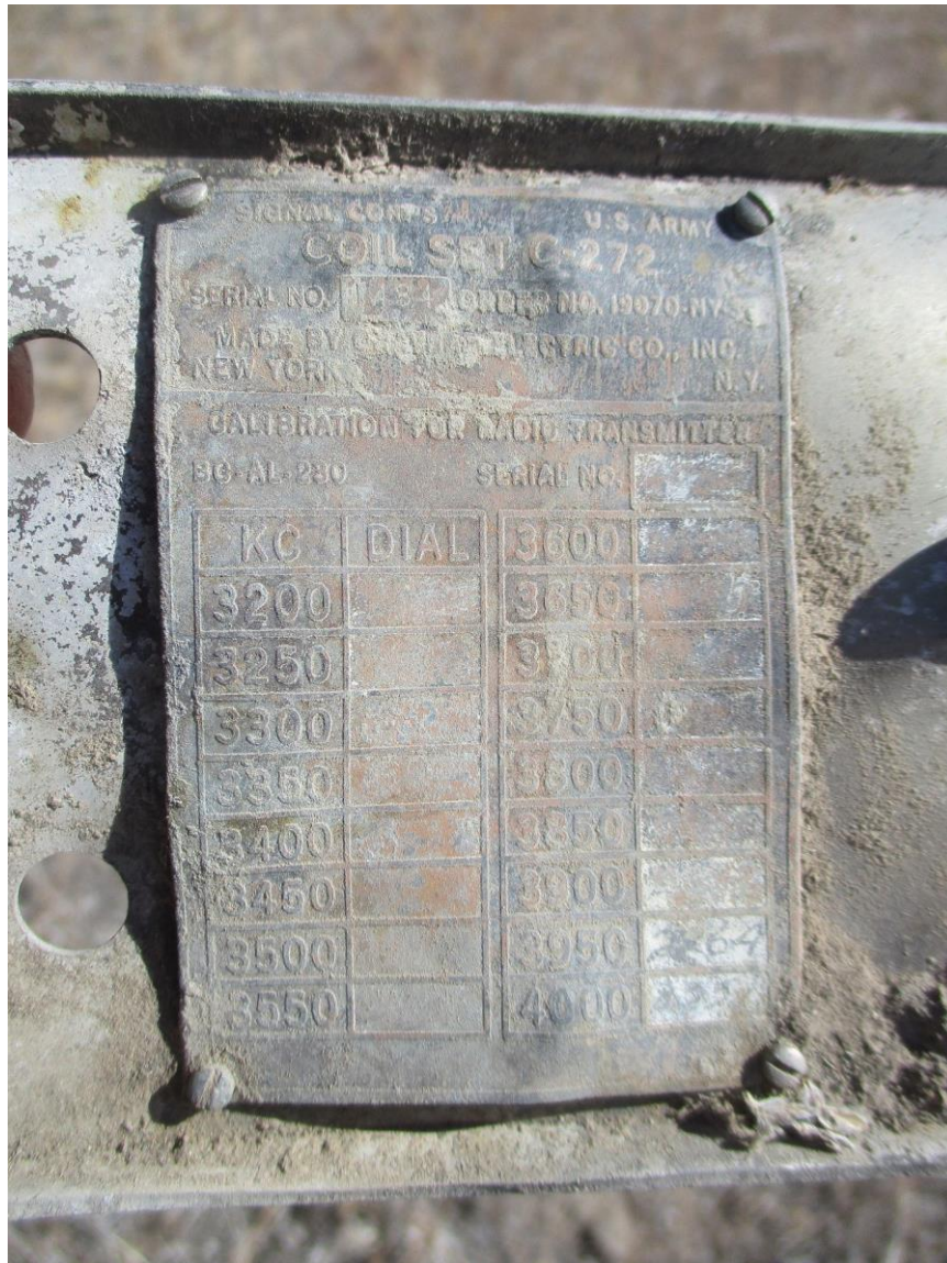
Data plate on a radio panel